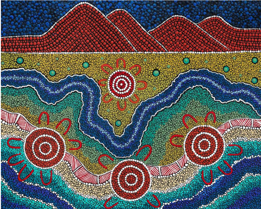
Artwork: On Country by Ammie Howell.

The City of Greater Geelong acknowledges Wadawurrung people as the Traditional Owners of this land. It also acknowledges all other Aboriginal and Torres Strait Islander People who are part of the Greater Geelong community today.