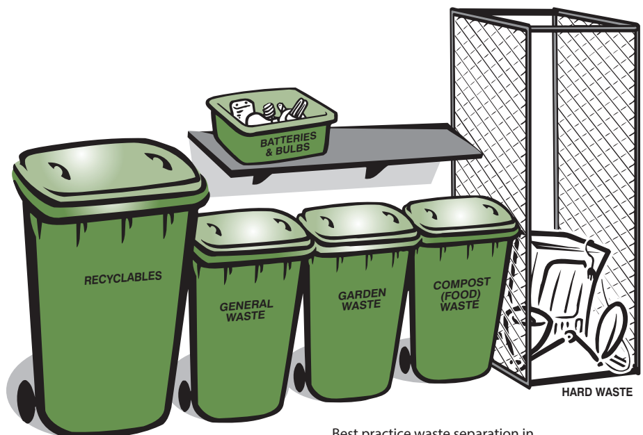
Best practice waste separation in multi-unit residential developments.

Construction sites can represent a great burden on local waterways. Site litter, paint, solvents, bricks, cleaning substances and clean-fill can all contaminate stormwater runoff. It is an offence under the Environment Protection Act to discharge contaminated water into the stormwater system. To avoid contamination, ensure that a drainage system is installed before construction activities commence and storm water is diverted from areas where soil is exposed.