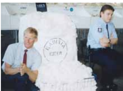
The Million Dollar Wool Bale sold at the National Wool Museum in 1995